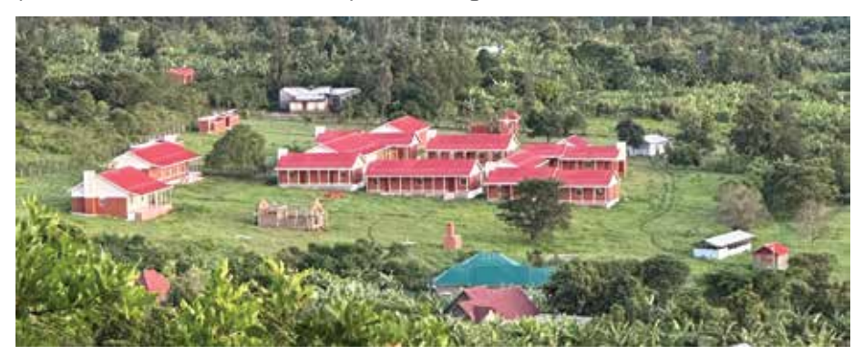
The new Clinic, the old clinic and Chief Practitioner Sarah Imucala

The original clinic was established almost two decades ago, in partnership with Ruwenzori Health Foundation UK. Shipping containers formed the basic accommodation with a dedicated staff managing to provide a high level of care with limited resources. A generous donation has enabled the construction of a forty bed cottage hospital. Phase one of the hospital has been achieved with the purchase of land, road construction, electrical supply and water supply. Phase two has secured the site, built wards, operating theatre, consultation rooms, accident and emergency, x-ray, scanning and administration rooms. In the next phase medical equipment will be brought in and staff at all levels recruited. We will seek to forge links with other health providers and medical experts in Uganda and further afield.